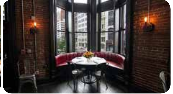
Wright & Co.

Now Open: Townhouse Detroit (left) with its striking atrium overlooking Woodward Avenue is in full swing with contemporary American cuisines, craft cocktails and more. Central Kitchen + Bar (center) in the First National Building is already a popular 130-seat gastropub in downtown Detroit at 660 Woodward with a view of Campus Martius Park. Wright & Co. (right), former Temple of Music and Wright Kay Jewelers, is now a new jewel on Detroit's restaurant scene. Located on the second floor of the Wright Kay Building on Woodward Avenue, this 100-seat eatery offers small plates and craft cocktails.