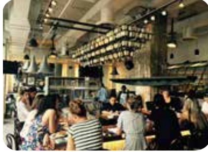
Central Kitchen + Bar