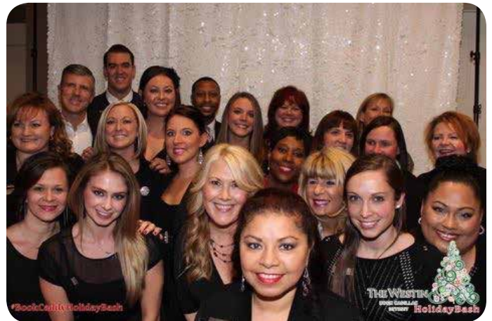
The Book Cadillac Sales & Catering Team

The 2015 Westin Book Cadillac holiday party welcomed hotel clients and friends for a sumptuous feast and live music. Everyone loved the polar bears.