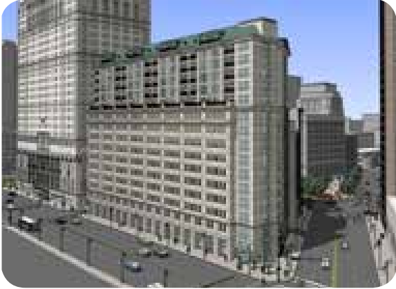
Rendering via Kraemer Design Group